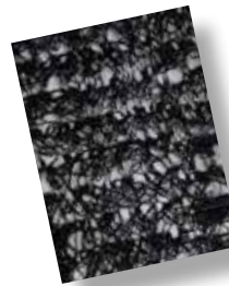
Driwall™ PCD is 0.125 - 0.75 inches thick (3.175 - 19.0 mm thick)

A filter fabric is heat-laminated or adhered to one side of the mat to hold soil or concrete away from the wall or deck and keep the drainage plane clear.