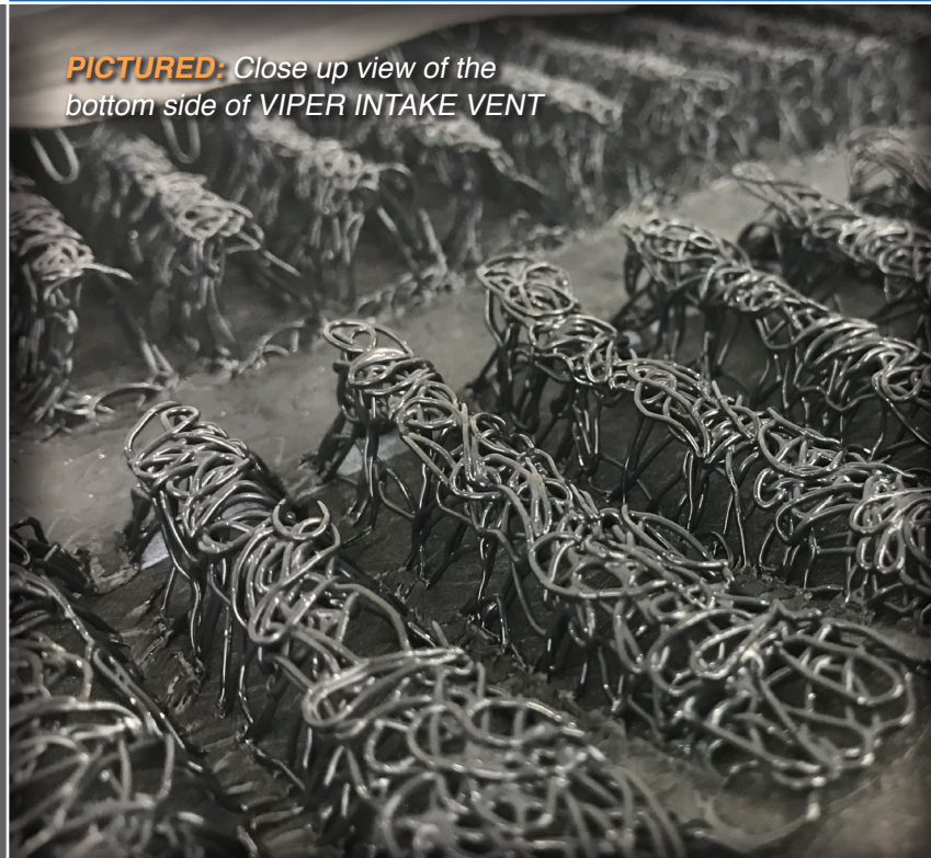
PICTURED: Close up view of the bottom side of VIPER INTAKE VENT